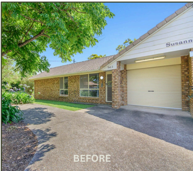
2/1 BROOKER COURT Raceview QLD 4305