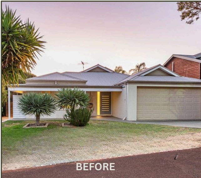
6 TARN VIEW Dunsborough WA 6281

These property transactions were purchased in the previous 15 months by investors and been either knock down & rebuilt, renovated or flipped for profit in the last 30 days.