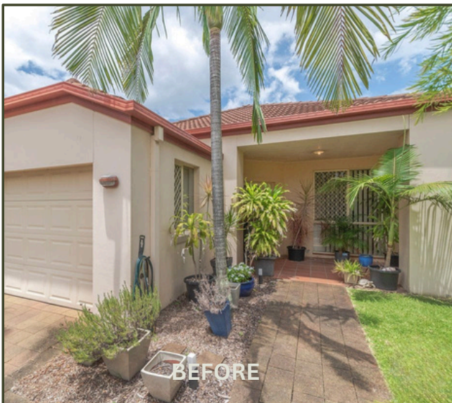
1 GLENALTA PLACE Robina QLD 4226