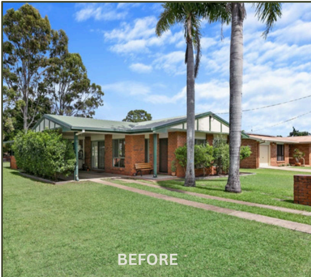
12 SERENITY DRIVE Tinana QLD 4650

These property transactions were purchased in the previous 15 months by investors and been either knock down & rebuilt, renovated or flipped for profit in the last 30 days.